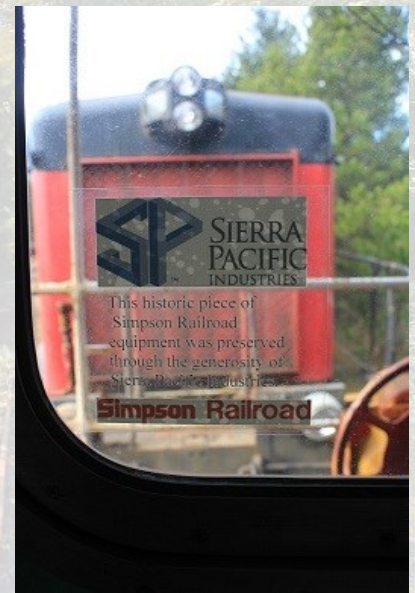
Right: Looking out the window of caboose 201 everyone will be reminded of SPI's generosity.

The Simpson Railroad website continues to grow in popularity. To date our website has been viewed in 16 countries around the world. Website visits have been from as far away places like Kenya & Kuwait. With Australia being our third most visited country. As example the first 8 days of March, on the strength of the loop track repair saw over 500 visits. The single day record currently sits at 283 visits. That is pretty good for a 10mile RR working towards starting excursion operation late this year. The majority of those visits come from information on social media outlets. Social media can be a strong allies in railroad and history preservation reaching many who would not know of our efforts otherwise.